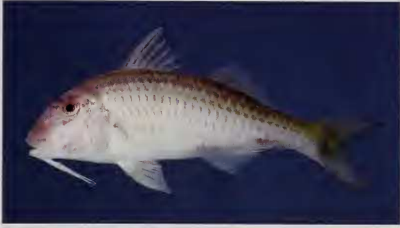
Fig. 9. Parupeneus seychellensis , SAIAB 77868, 170 mm SL, Mahé, Seychelles, 17 m.

Baie aux Chagrins, 4.6290998°S, 55.3767014°E, rotenone, 17 m, P.C. Heemstra, E. Heemstra, M. Smale, K. Moots, and M. Mwale, 7 May 2005.